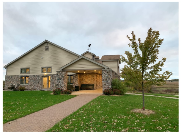
The Lussier Family Heritage Center

On a cool and blustery mid-October Wednesday a group of family caregivers and their loved ones with memory loss gathered at the beautiful Lussier Family Heritage Center in Madison for a day of relaxation, pampering, stories, and activities. The setting beckoned to participants with walking paths and stunning vistas from balconies overlooking prairies dotted with late-blooming native flowers. The landscape populated with “dances” or “swoops” of sandhill cranes was alive with the music of their loud, rattling bugle calls and the familiar song of red-winged blackbirds. Inside, caregivers participated in sessions to help them incorporate nurturing practices into their routines and connect with other caregivers for fellowship and support. The event was sponsored by the Aging and Disability Resource Center (ADRC) of Dane County and the Area Agency on Aging of Dane County along with the Alzheimer’s Association of Wisconsin and the Alzheimer’s and Dementia Alliance of Wisconsin.